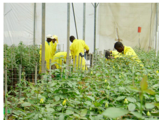
Caption / credits