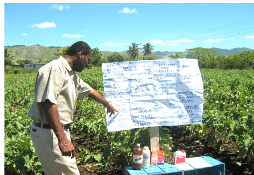
Caption / credits