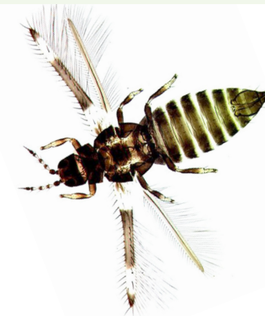
Adult female American bean thrips - Caliothrips phaseoli - Laurence Mound ANIC, CSIRO

The International Plant Protection Convention (IPPC) is an international agreement on plant health to which 170 signatories currently adhere. It aims to protect cultivated and wild plants by preventing the introduction and spread of pests. The Secretariat of the IPPC is provided by the Food and Agriculture Organization of the United Nations . Find out more about the IPPC .