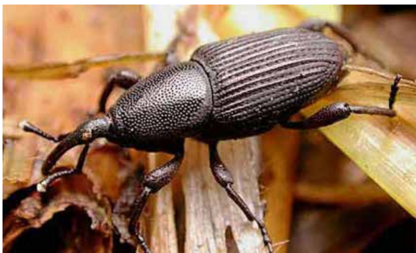
Figure 5: Adult banana weevil, Cosmopolites sordidus (Germar).