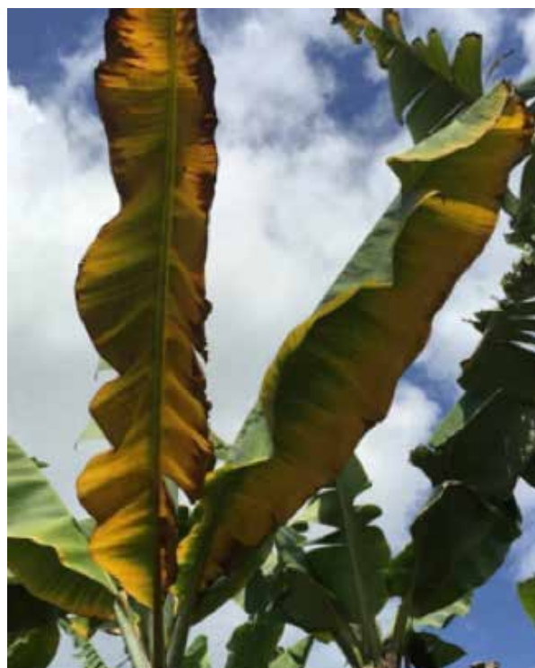
Figure 2: Early stage of FOC TR4 infection – leaf yellowing and edges turn brown.

The pseudostems (the part of the banana tree that looks like a trunk) may split lengthwise and, when cut open, a reddish-brown discolouration of the vascular tissue is typically seen (Figure 3). A reddish-brown discolouration may also be seen in the roots and rhizomes. New leaves may be paler and shorter than normal. Fruits exhibit no symptoms.